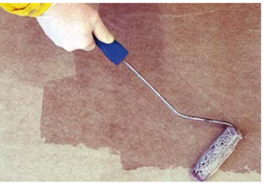
Waterproofing of wet rooms