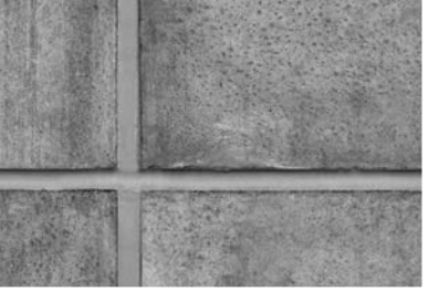
Sealing of stone, brick and concrete joints