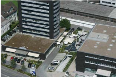
Roofing for green roofs