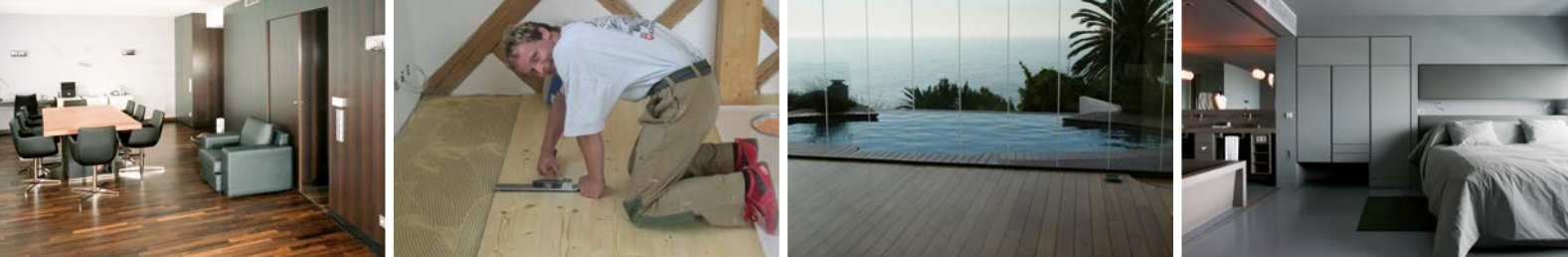
Wood floor bonding for all types of rooms and uses