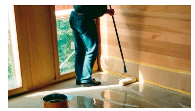
Sika provides systems that require lower maintenance