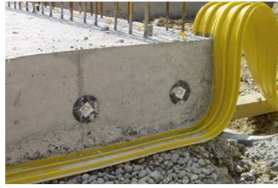
Waterstops for integral joint waterproofing