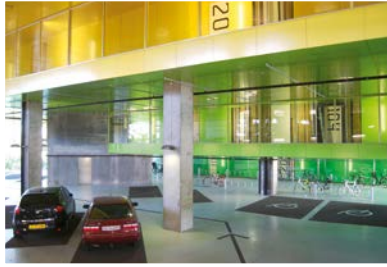
Flooring and coating solutions