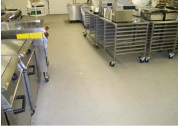
Floors for food storage areas