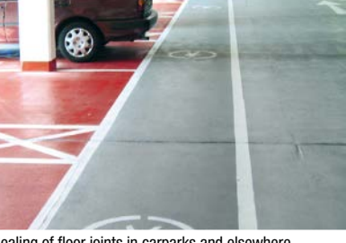
Sealing of floor joints in carparks and elsewhere