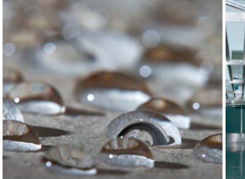
Sika's water and dirt repellent Products keep your surfaces longer free from contamination.....

Maintenance is also a very important topic when it comes to hotel projects. Sika can offer you a broad range of products that can reduce maintenance to a minimum. From hydrophobic protecting products to highly abrasive sealers which protect the building components from contamination.