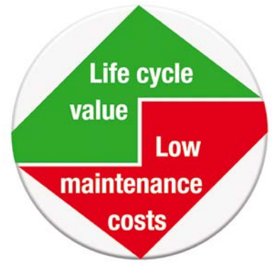
... and reduce maintenance cost and prolong the The use and application of Sika Protective products leads to less frequent maintenance and longer life time.