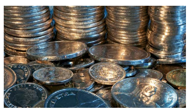
Sooner opening = earlier cash flow