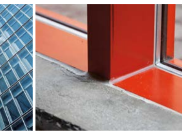
Sealing of connection joints around windows and doors