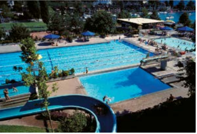
Sikaplan® sheet membranes for waterproofing